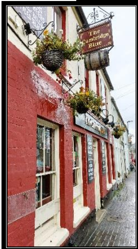
Cambridge Blue in the Rain

We met up for lunch at The Prince Regent in Hills Road and by the time we left we enjoyed brilliant sunshine. Typical of our weather!